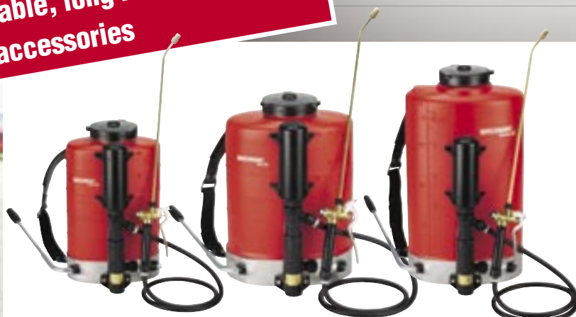
Flox 10 l